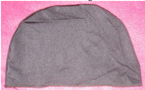
Firstline head scarf antron-lycra Brand new – asking $10/BO