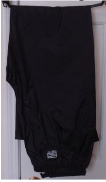
AeroTex Rain Pants sz XXL Brand new – asking $30/BO