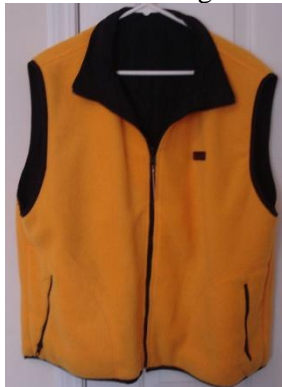
(2) Timberline reversible yellow-black fleece vest sz L Brand new – asking $25/BO