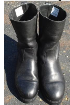
Cruiserworks boots, waterproof, almost new, excellent condition, new factory installed sole/heel, and refinished uppers, sz 10 1/2, asking $80/BO