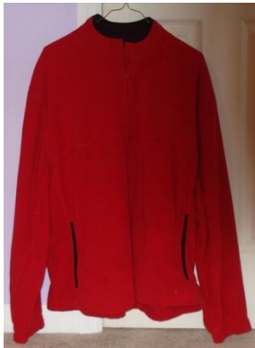
Fleece sweater-jacket sz L Brand new – asking $25/BO