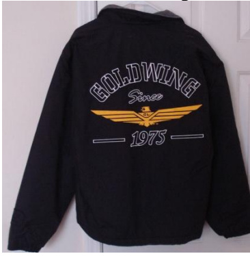
Honda fleece Gold Wing jacket sz L - Brand new – asking $50