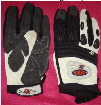
(2) Cortech DX summer gloves, good condition – asking $10 pr/BO