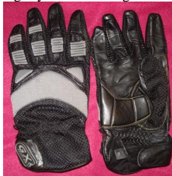
Cortech GX-Air mesh gloves sz XL Slightly used – asking $10/BO