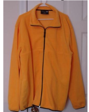
Fleece sweater-jacket sz XLT Brand new – asking $25/BO