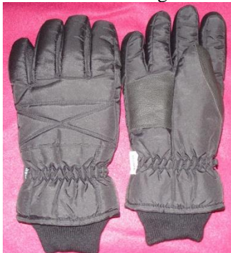
Broner thinsulate winter sz XL Almost new – asking $20/BO