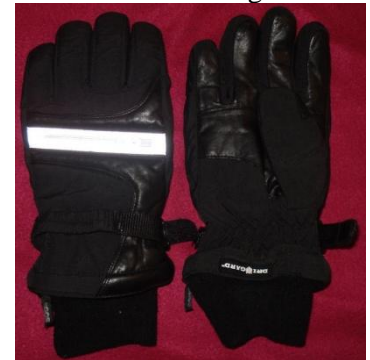
GCS lined winter gloves Ladies sz M Almost new – asking $20/BO