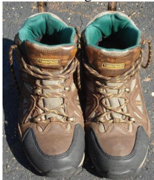
Laketrail HydroGuard hiking/riding boots, asking $10/BO